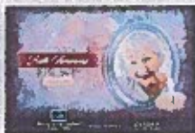
Rose (shown above)